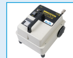
Compressor Minicat for plugs