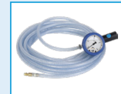
Non Safety inflating hose