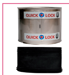
Quick Lock End of Liner